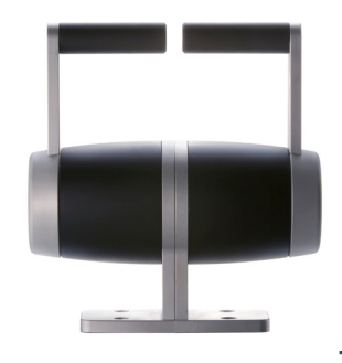
Dual top mounted throttles for twin engine applications