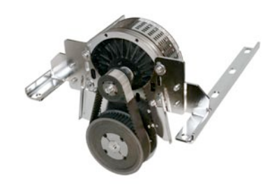
Motor, included console, with reduction and mounting brackets