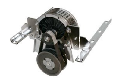
Motor, included console, with reduction and mounting brackets