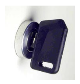
Key Switch System