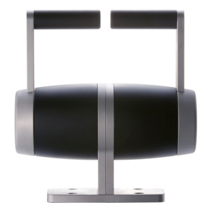
Dual top mounted throttles for twin engine applications