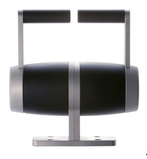
Dual top mounted throttles for twin engine applications